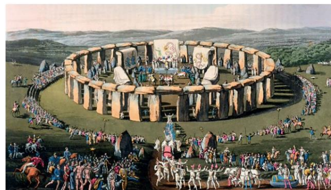
Stonehenge Artist impression

People lived in these during the Iron Age within hillforts.